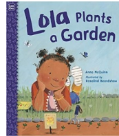
Click on the book cover to open the read aloud.

Check out these photos of an actual bean plant starting from a seed!