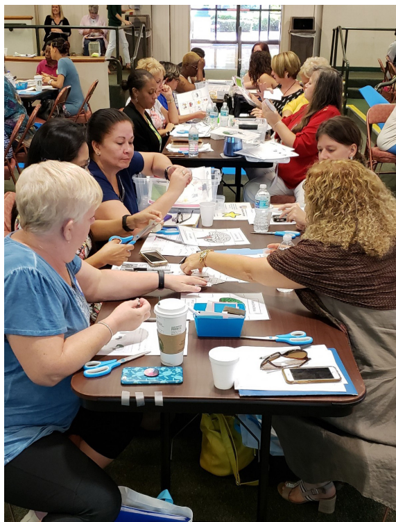
ABOVE: A commitment to the CALM method during a group session at teacher training. Teachers gather at an Hillsborough Community College training event.

“No matter your role (teacher, parent, grandparent, citizen) you can have a profound impact on a child.”