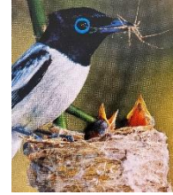
Who is gobbling bugs?

“bunnies huddle, noses t witch- t witch- t witching.”