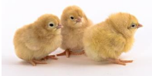
What baby animal peeps?

“...wiggly black tadpoles wait, f eeling f roggier by the day.”