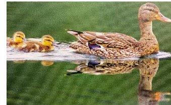
Who has webbed feet and piddle-paddles?

“ S plish- s plash! In they go, webby feet p iddle- p addling.”