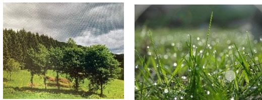
What's happening here?

“Spring drags a grey blanket across the sky. P lip- p lop- p lip.”