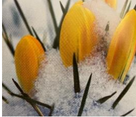
What season is coaxing color?

“ c oaxing c olor from the winter-brown woods.”